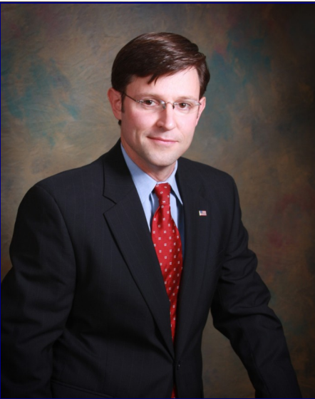
Congressman Mike Johnson

Congressman Mike Johnson is a Republican member of Congress proudly serving Louisiana's Fourth District. He represents nearly 760,000 residents of 15 parishes in the north-west and western regions of the state. He was appointed to the House Judiciary Committee and two of its subcommittees. He also serves on the House Natural Resources Committee and the Subcommittee on Water, Power and Oceans. A dedicated husband and father of four, Mike is a constitutional law attorney. He served in the Louisiana Legislature from 2015-2017.