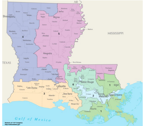
Louisiana Congressional Districts